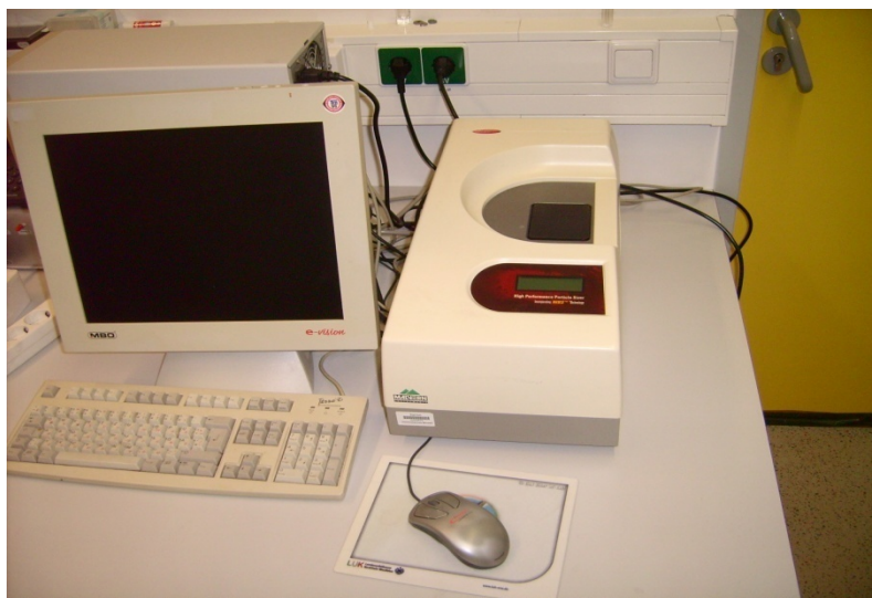
2: Malvern High Performance