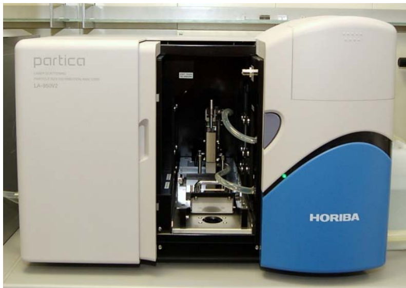
1: Horiba LA-950 organic