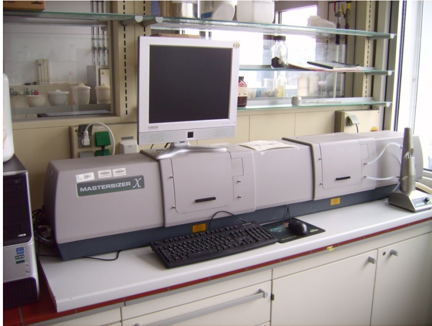
3: Malvern MasterSizer X